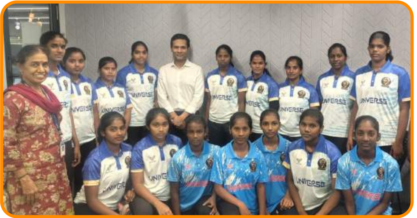
Nutrition hampers distributed to the kabaddi team from Kannagi Nagar in January 2026